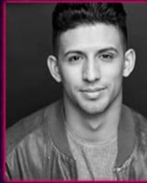
DAVID WRIGHT BLAINE